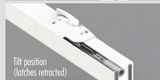
Tilt position (latches retracted)